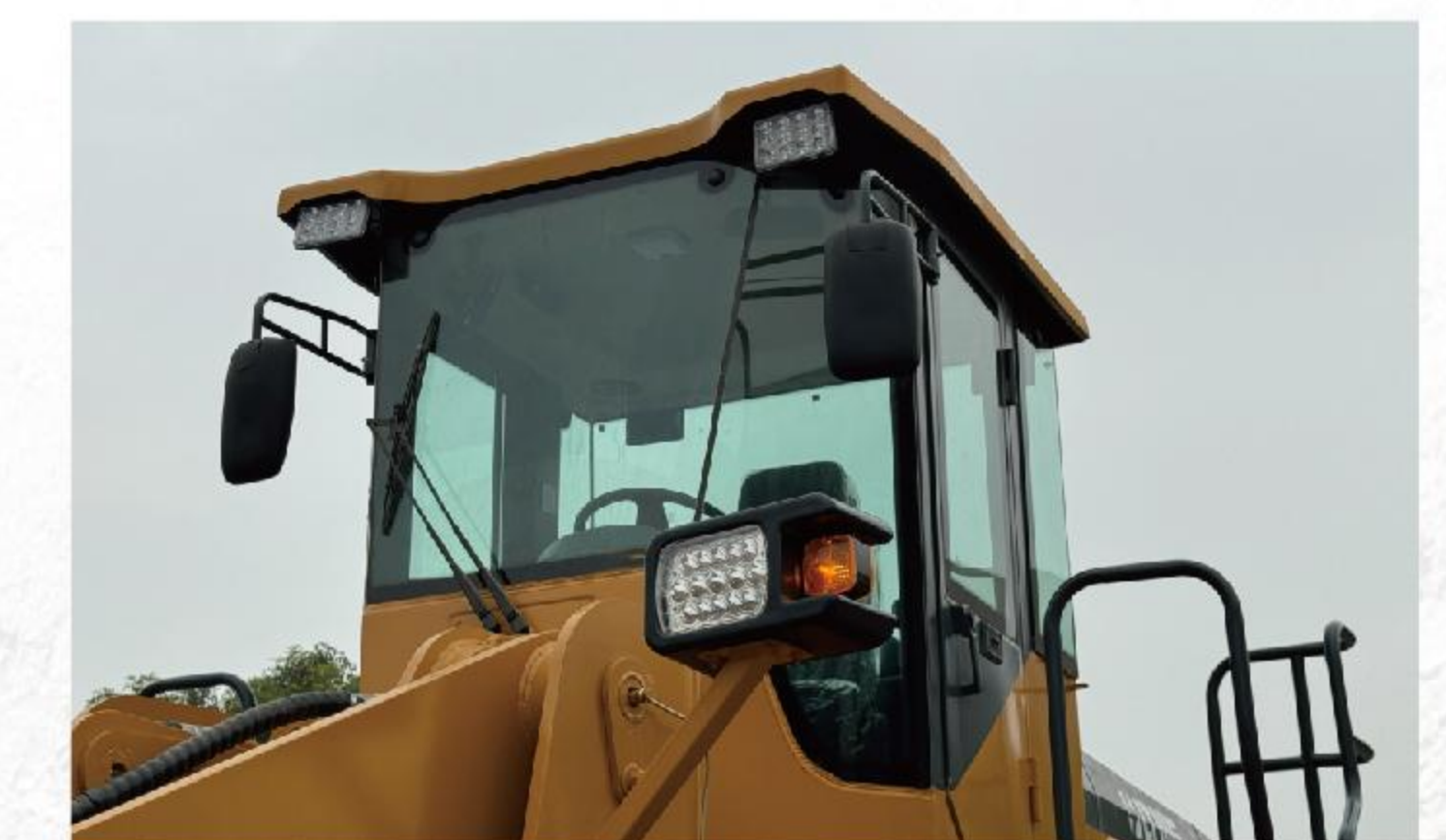
Ultra-quiet, monolithic cab with good sealing, more space and better view. 超静音、整体式驾驶室密封性好、空间更大、视野更好。