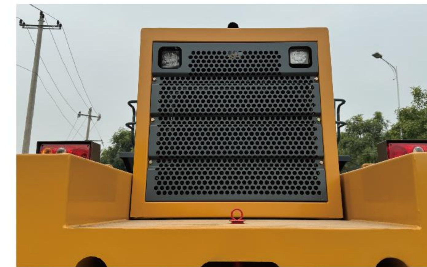
Honeycomb type heat dissipation hood, effectively improve heat dissipation performance. 蜂窝型散热器罩, 有效提高散热性能。