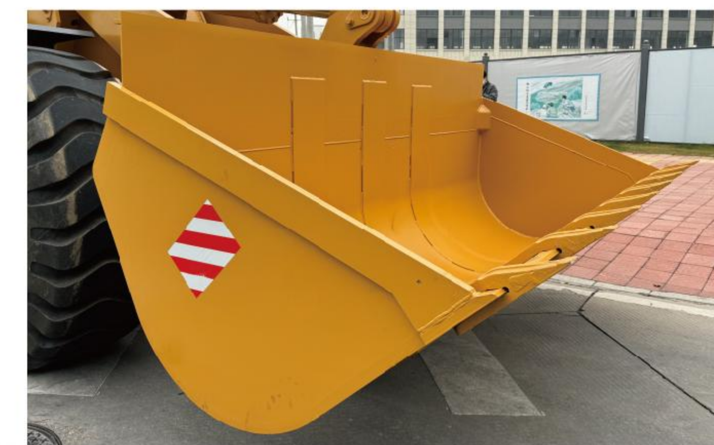
Optimise the bucket discharge plate structure, easy to discharge and reduce the impact; the service life is greatly extended. 优化铲斗卸料板结构, 便于卸料, 减少冲击; 使用寿命大幅度延长。