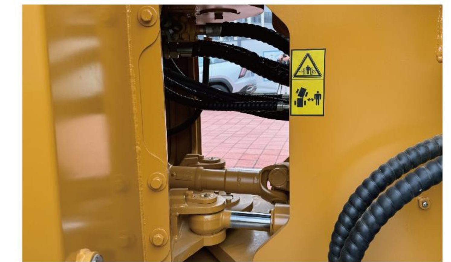
The front and rear frames adopt a large articulation and heavy-duty design that disperses the force at the articulation, reduces the load-bearing force of the articulation pins and improves the service life of the bearings. 前后车架采用大铰接、重载型设计分散了铰接处的作用力, 降低铰接销的承重力, 并提高轴承使用寿命。