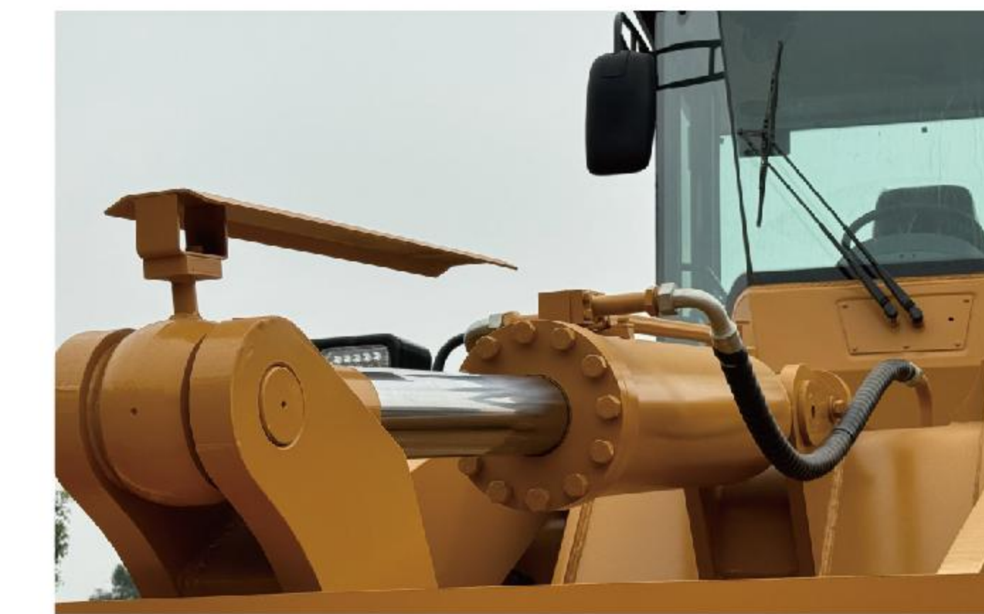
Adopting large-displacement double-pump merging hydraulic system, with large cylinder power, fast arm lifting and faster loading speed. 采用大排量双泵合流液压系统, 油缸力量大、举臂快、装车速度更快。