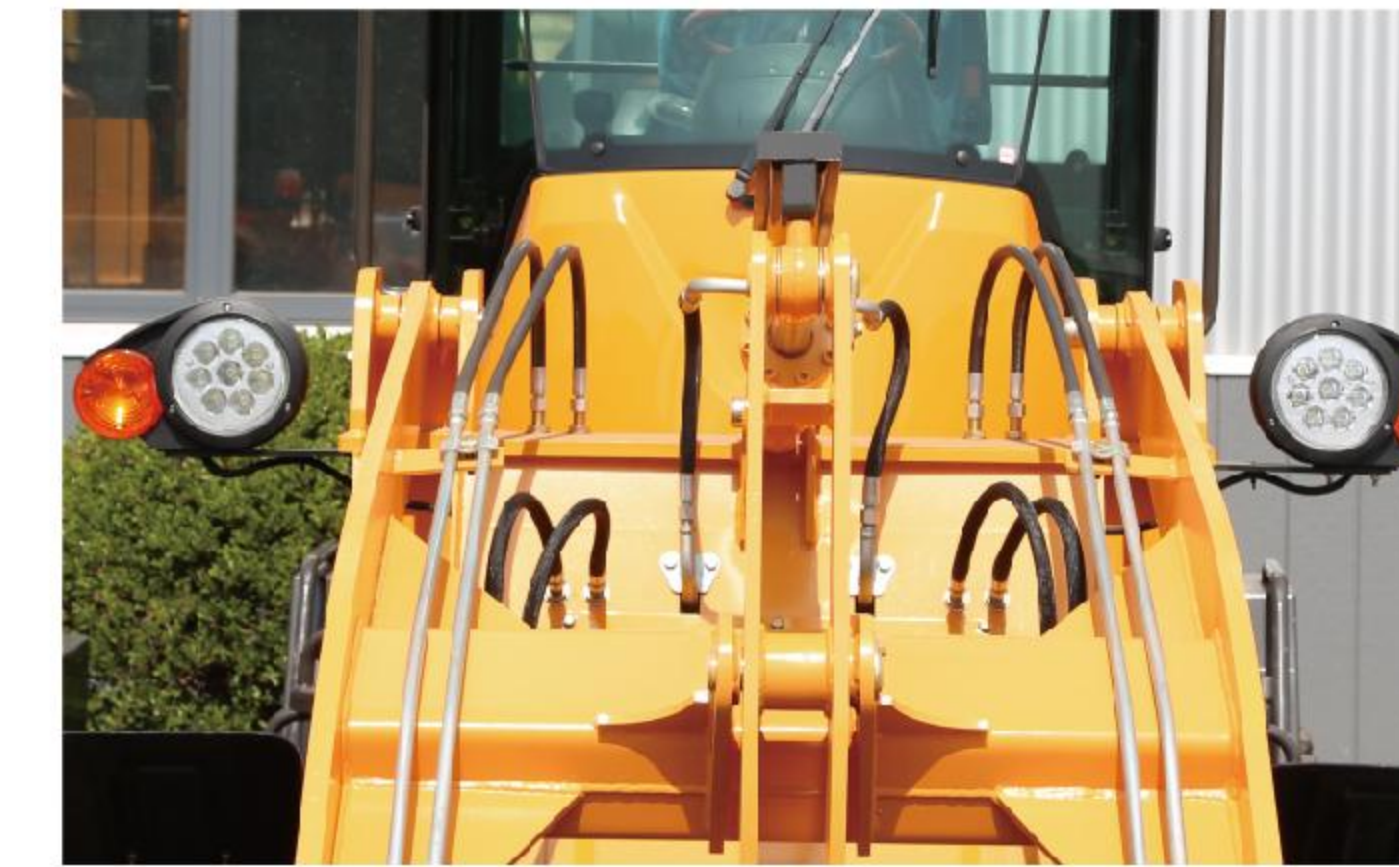
Enhanced hydraulic cylinders for robust operation and powerful lifting effect. 增强型液压油缸, 实现稳健运作与强大举升效果。