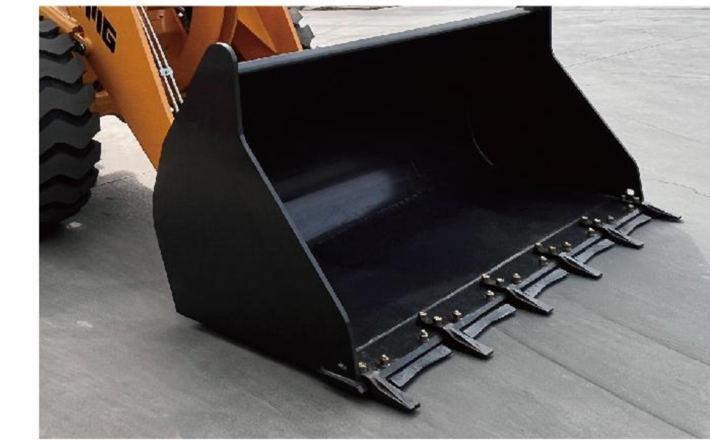
Equipped with high wear-resistant blade, which improves the service life of the bucket. 配备高耐磨的刀板, 提高了铲斗的使用寿命。