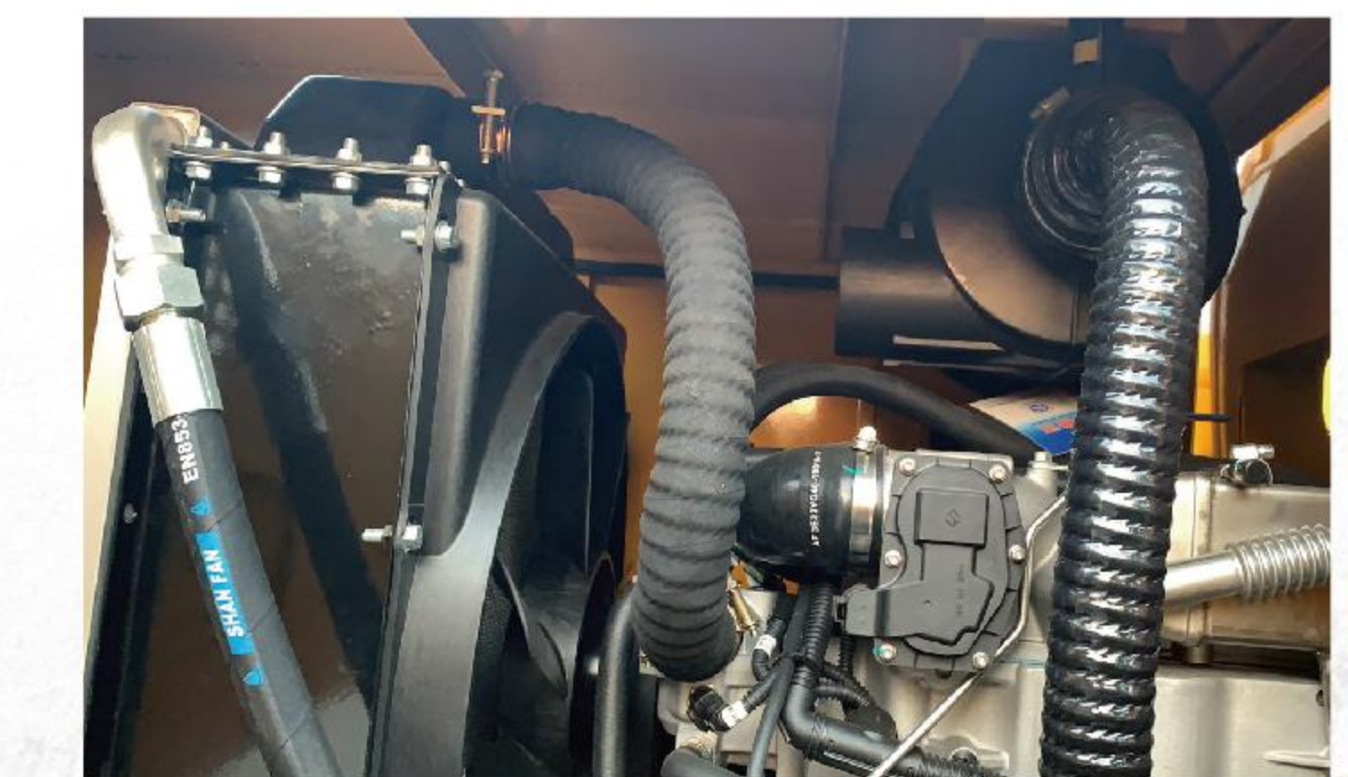
Featuring energy-saving and emission-reducing advantages along with powerful performance.