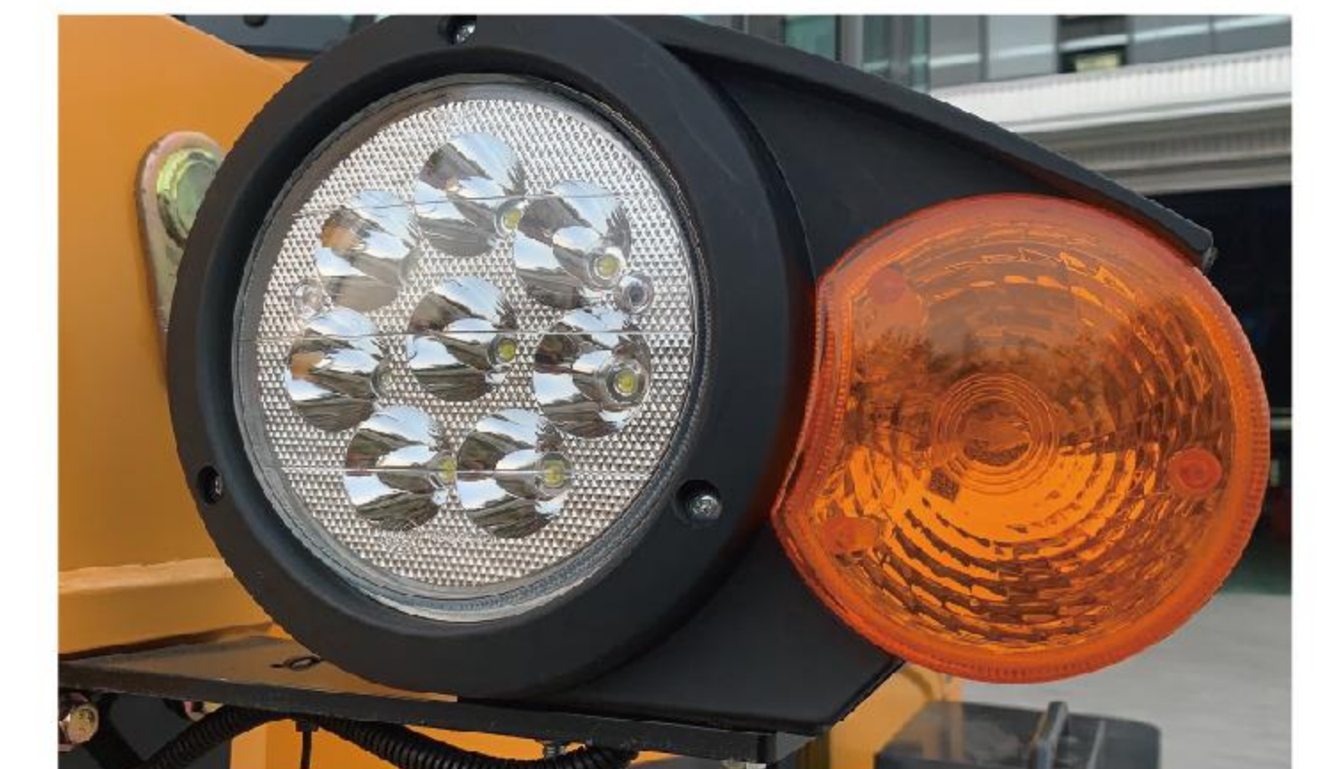
High-efficiency LED technology with high brightness and long irradiation distance ensures sufficient illumination at night or when working in dark places.

采用高效的LED技术, 亮度高、照射距离远, 确保夜间或暗处作业时能提供充足的照明。