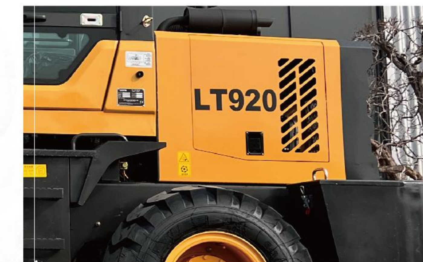
Wing spread hood, large opening hood side door, spacious maintenance space, convenient daily maintenance.